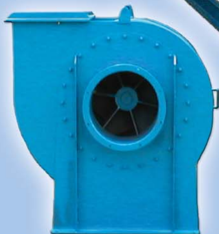
Paper Handling Fan