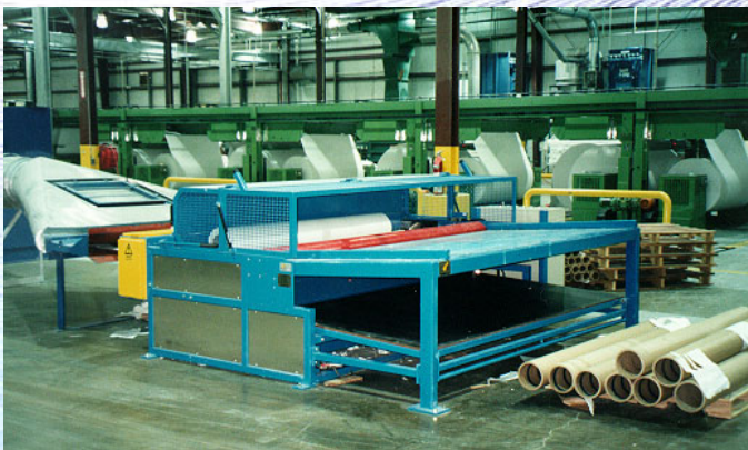
Core stripper feeding the paper to a chopper fan which blows the paper to a baler or pulper.