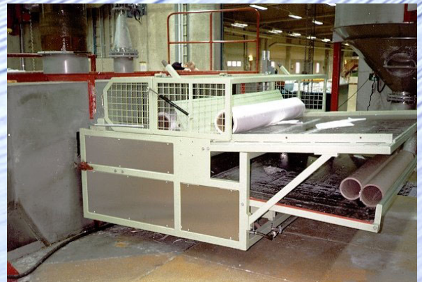
Core stripper feeding the paper directly to the pulper