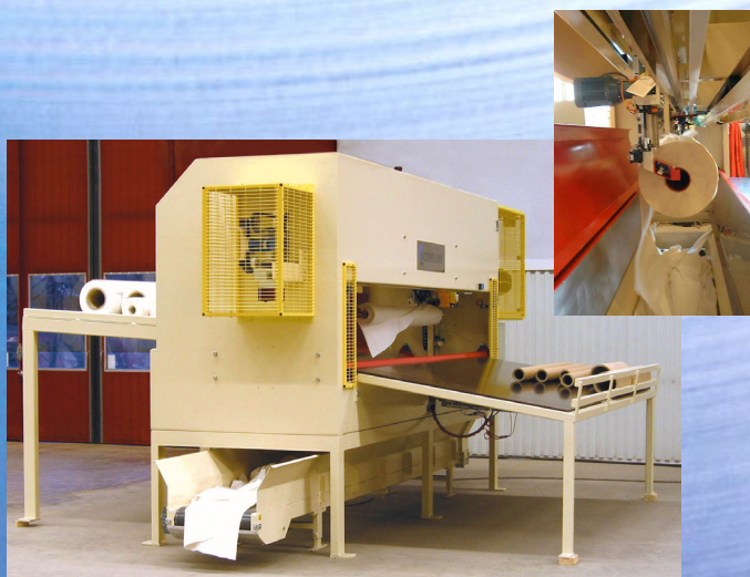
The butt roll cutter is primarily used for tissue or when feeding to container, balers etc.